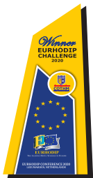
Eurhodip Challenge Award 2020 First Position Holder amongst the top European Hotel Schools' Competition