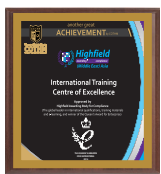
Highfield UK Award International Training Centre of Excellence 'The Queen's Award for Enterprise'