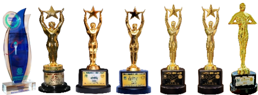
Consumer Choice Award Best Hotel School of Pakistan 2015-16-17-18-19-22