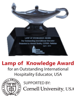
Lamp of Knowledge Award for an Outstanding International Hospitality Educator, USA SUPPORTED BY: Cornell University, USA