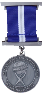
WORLD CHEFS' PRESIDENT'S MEDAL