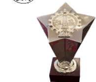
Prime Minister's Achievement Award Best Hotel School of Pakistan